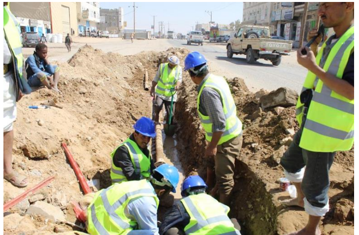
Rehabilitation and expansion of water supply system

In April, two health facilities in Marib City were provided with a water supply, benefiting a total of 1,531 patients (on a daily basis) and three IDPs school in Aljufainah IDP camps. In the Al-Wadi camp, IDPs were connected to a water supply that benefitted 5,278 school children (48 per cent girls). In June, a total of 208,585 people including children benefitted