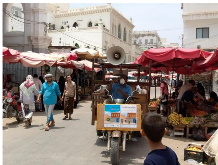
Public Service Announcement in a southern market on COVID-19

As part of the integrated multi-sectoral response to malnutrition in Yemen, members of mother-to-mother clubs and community volunteers, including religious leaders, were mobilized to engage with communities to promote positive nutrition practices, support with referring malnutrition cases and increasing demand for health and nutrition services. Mass media support was provided for this intervention through 25 radio stations.