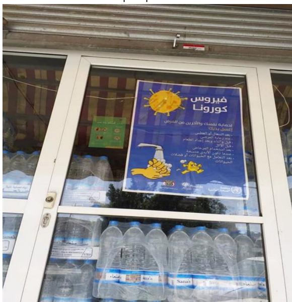
Communication poster on COVID-19 in a local shop in the south

Communication materials were placed in high traffic locations such as crossroads, malls, markets, etc., while consumer commodities were branded with vaccination messages. Mass media support for the vaccination campaign was also provided through 25 radio stations and four TV channels which aired the campaign messages through flashes, public service announcements, and dedicated discussion programmes on the COVID vaccine. An estimated 12-16 million people were reached.